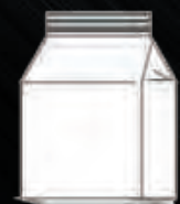
Block Bottom bags